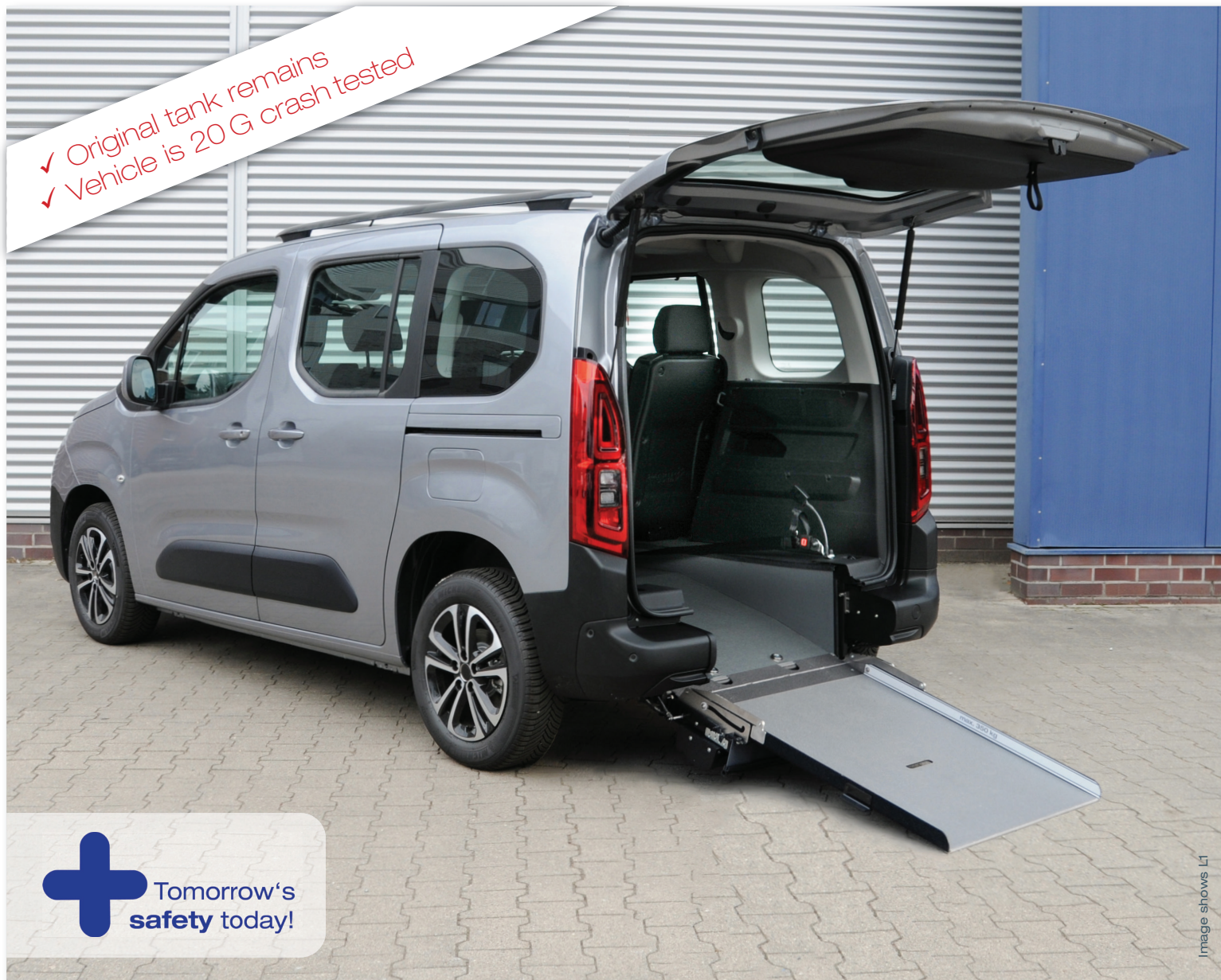
Image shows L1